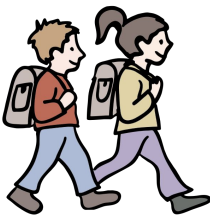
Traditional in-person learning